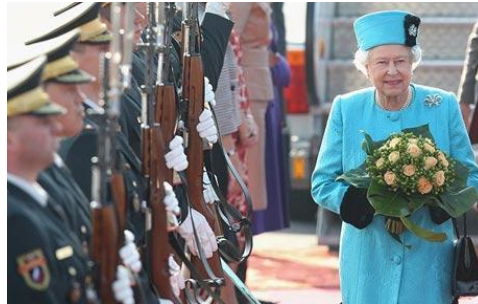
The Queen arrives to Slovenia.

Brdo estate north of Ljubljana, a picturesque setting with a dramatic view of the Alps.