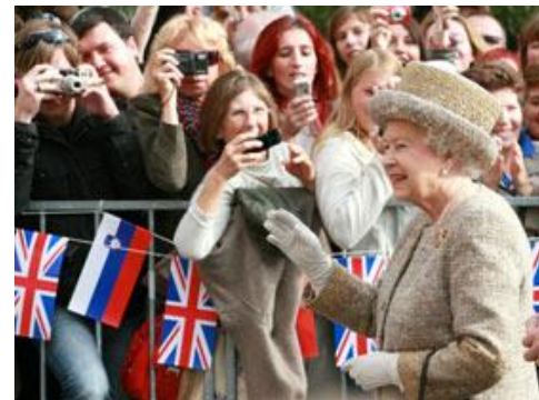
The Queen during her stroll in Ljubljana.

They founded the farm in the village of Lipica -- or Lipizza in the Italian spelling -- in what is now Slovenia.