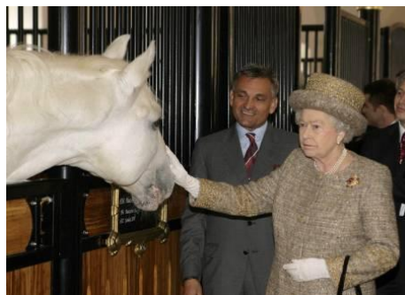
085 Favory Canissa XXII with Queen Elizabeth

The 428-year-old stud farm dates to the time of the Austria's ruling Habsburgs, who went to Spain to buy horses for an empire that stretched across much of Europe.