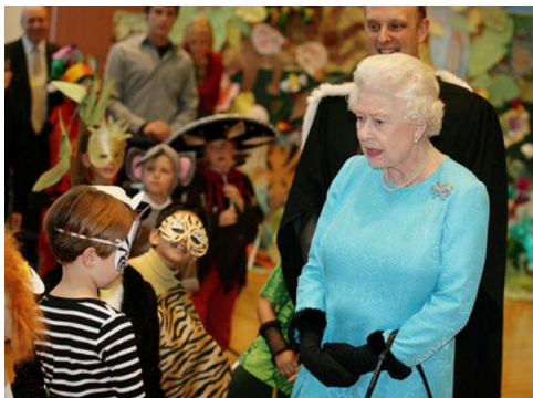
The Queen with the school children from a musical