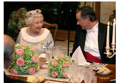
Queen Elizabeth and President Türk at the banquet at Brdo Castle

The Queen meanwhile underlined Slovenia's success as EU president, saying it was all the more striking considering that Slovenia had become an independent country only 17 years ago. "Slovenia's transformation since 1991 is a remarkable tribute to the country's energy, vision and determination."